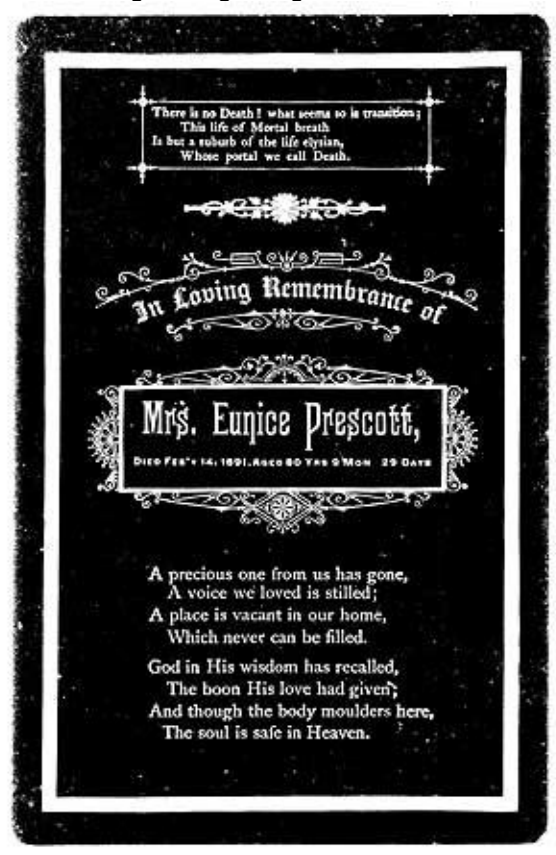
"In loving remembrance of Mrs. Eunice Prescott, died Feb'y 14, 1891, aged 80 yrs 9 mon 29 days."

A later style of mourning card, with gold engraving on black, was used well into the 20<sup>th</sup> century.